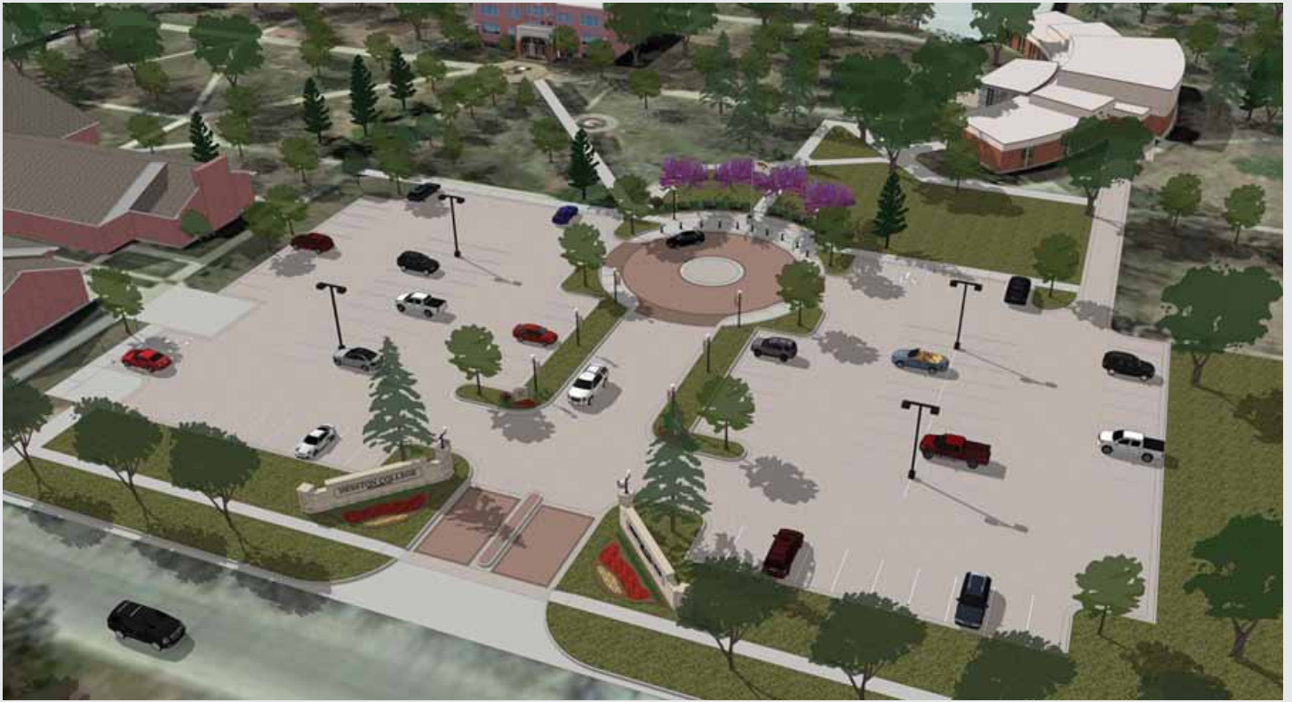
Shelden Architecture (Wichita, Kan.)